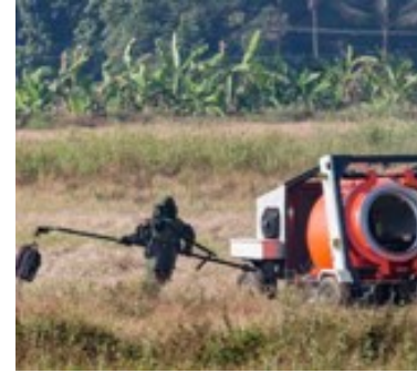
'Live' bomb found in Mangalore Airport; triggers panic