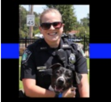
Hero Down: Officer dragged by suspect's vehicle, pinned against a tree