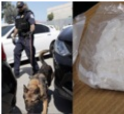
Grandmother, granddaughter team busted smuggling 200 pounds of methamphetamine