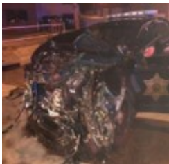
Photos show aftermath of crash involving deputy and suspected impaired driver

Tripwire recognizes January 27 as the 75th anniversary since the liberation of Auschwitz and support our global partners, ensuring the safety and security of all faiths. Our team of experts are dedicated to providing training and security for all faith based organizations.