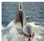
Death from the Deep: The